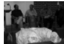
Brain Drain Forum

Pictured at the right is the Faculty Panel at the African Students' Organization's First Annual Forum "Brain Drain: Challenges and Opportunities for Africa."