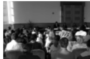
International Careers Workshop

Five days of workshops brought in experts and representatives to discuss international career possibilities and focused on business, non-profit, education and research, and government and inter-governmental sectors.