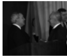
The Ambassador of Morocco who came to campus in Spring 2004