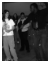
Batamaka at Global Fest